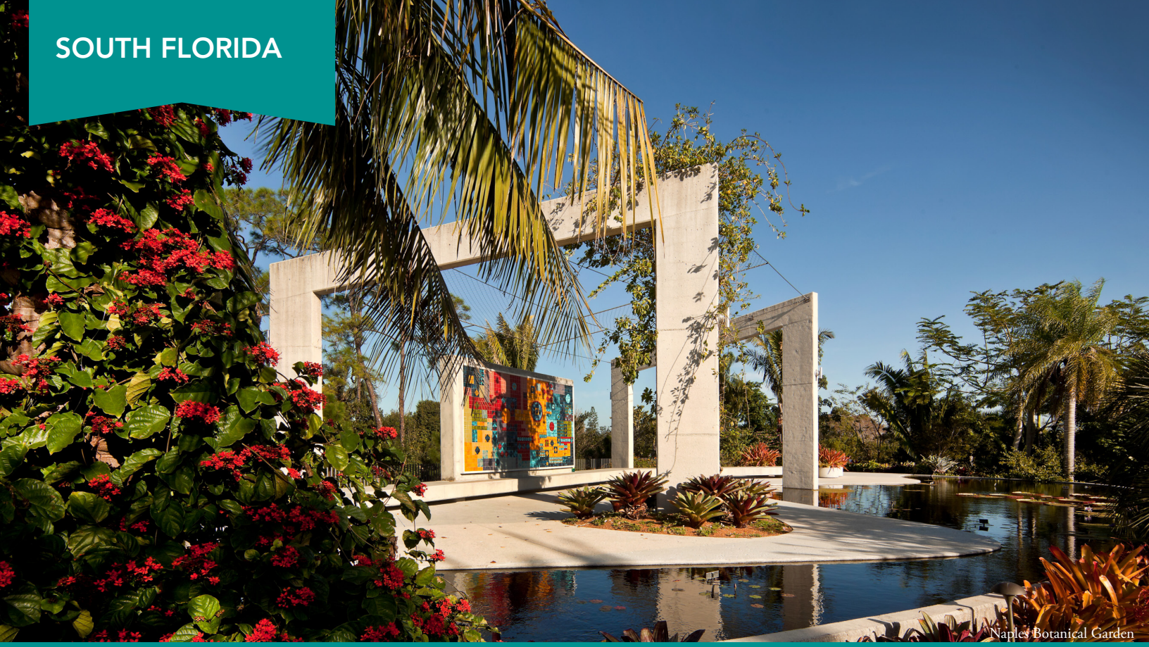
Naples Botanical Garden